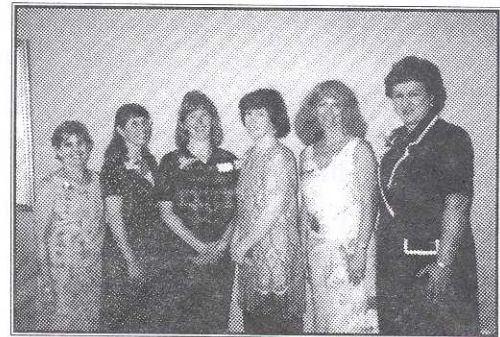
Community Leaders and Transfer members at the June 2, 2002 Award Ceremony.