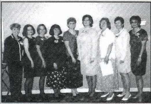
(Officers and Committee Members at Induction)