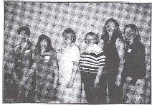
2002 BSN Students