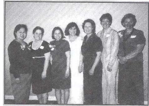
2002 MSN Students